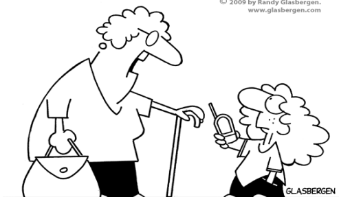
"Wireless communication is nothing new. I've been praying for 75 years!"

© 2009 by Randy Glasbergen. www.glasbergen.com