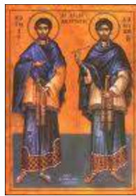
STS. COSMAS AND DAMIAN NOV. 14